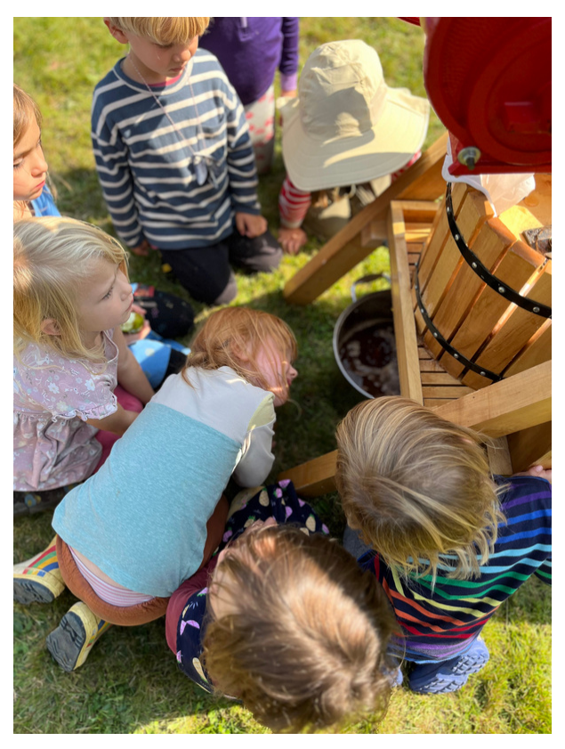
Sweet Ferns press apples at Leland Point